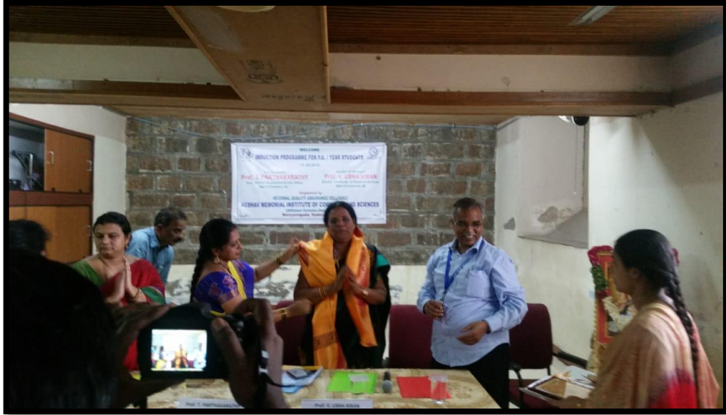
Felicitation to Resource person