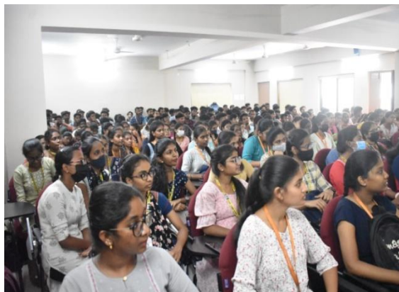
Target Audience of BSc VI & IV SEM (MSCs & MPCs)