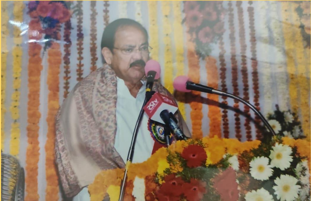
HON'BLE VICE PRESIDENT OF INDIA SRI.M.VENKAIAH NAIDU