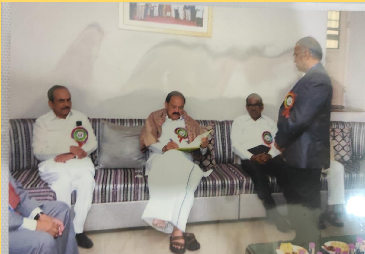
M.VENKAIAH NAIDU, VICE PRESIDENT OF INDIA