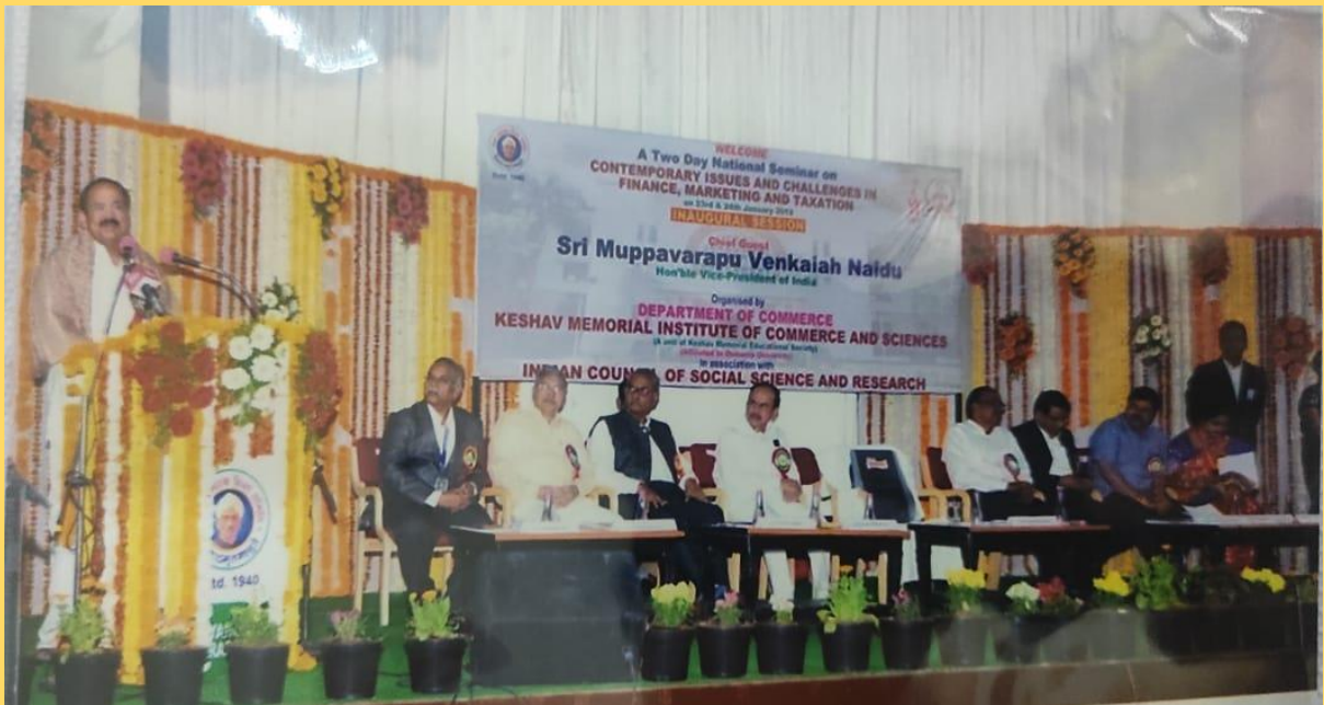
INAUGURAL SESSION OF NATIONAL SEMINAR