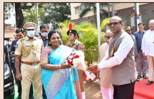
Hon’ble Governor of Telangana Smt. TAMILISAI SOUNDARARAJAN Visited our campus on 26th of November 2022