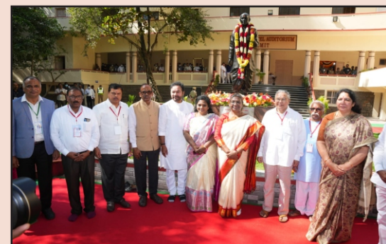
Hon’ble President of India Smt. DRAUPADI MURMU Visited our campus on 27th of December 2022