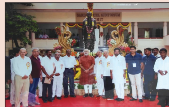
Sri NARENDRA MODI Unveiled the Statue of Sardar Vallabh Bhai Patel in our Campus on 11th of August 2013