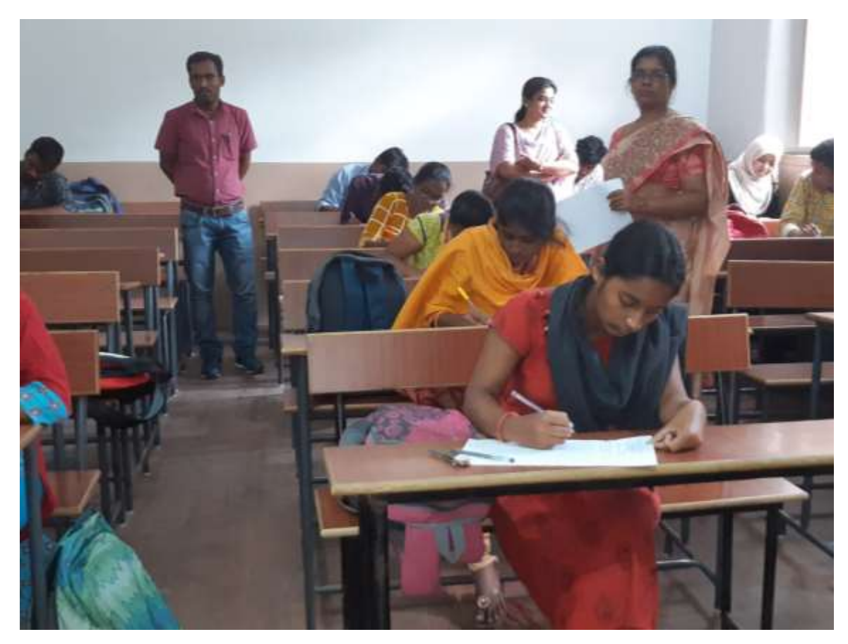
ESSAY WRITING COMPETITION CONDUCTED ON DECEMBER 2019