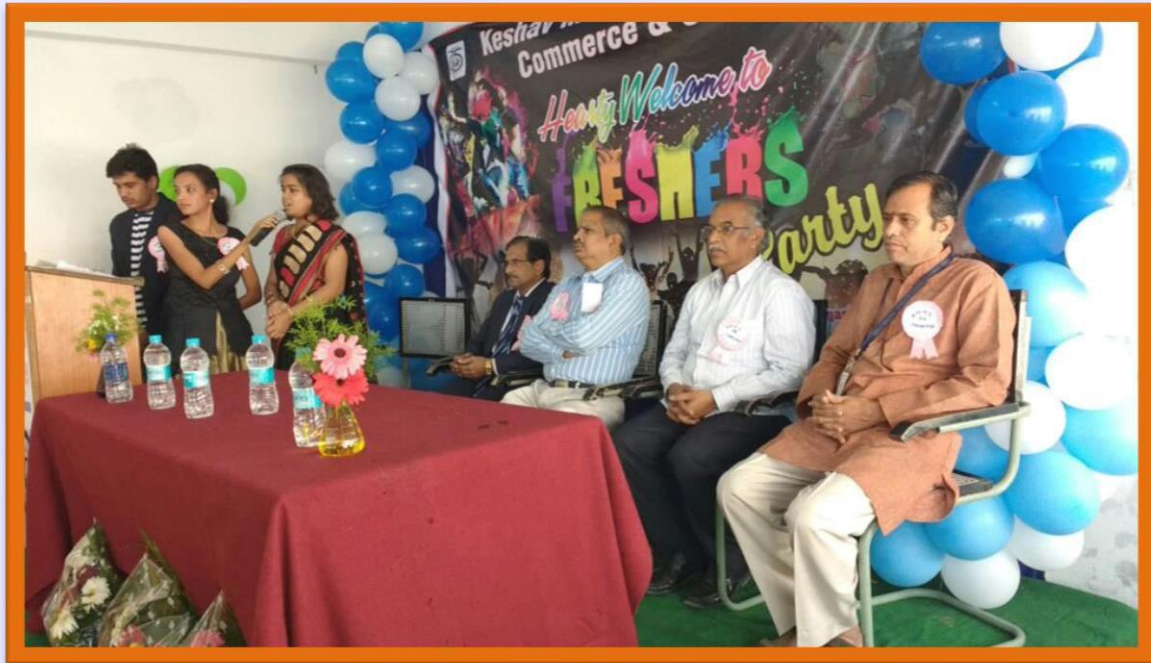
I year students sharing their experience