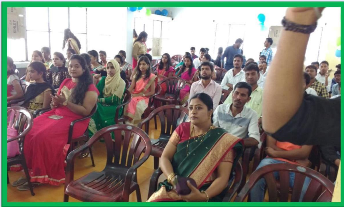
Gathering of students and staff at PG Block seminar hall for fresher's party