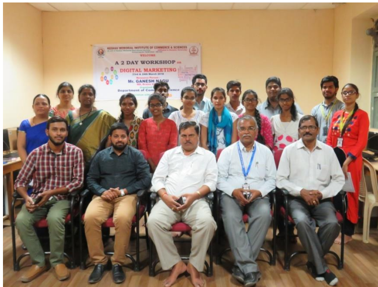
Concluding photo with the participants