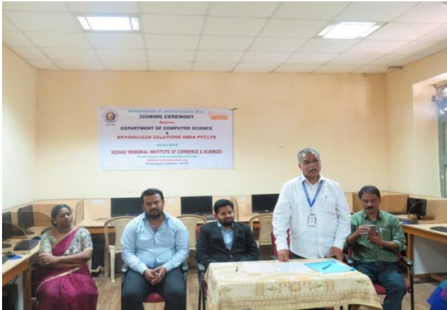
Principal, KMICS addressing students at the MoU Ceremony