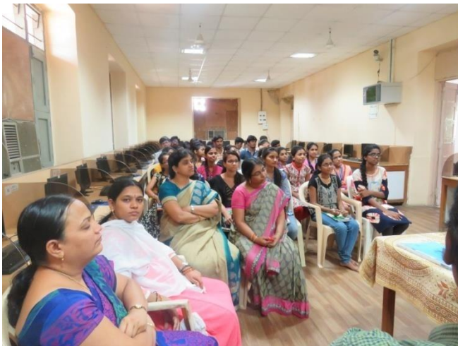
Faculty and students at MoU Signing Ceremony