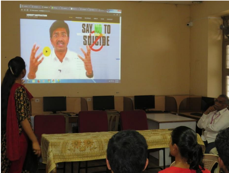
Students Explaining about the website done by them