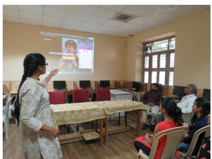
Students Explaining about the website done by them